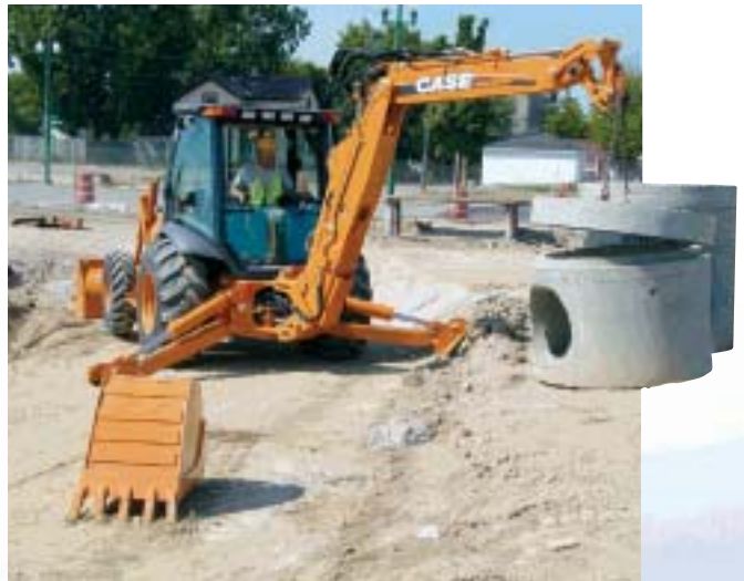
The M Series 2 provides exceptional craning power even when the Extendahoe® dipperstick is fully extended. The rugged external slide design reduces dirt ingestion and extends service life.

improved surfaces or provide the stability necessary for maximum crowd force in soil.