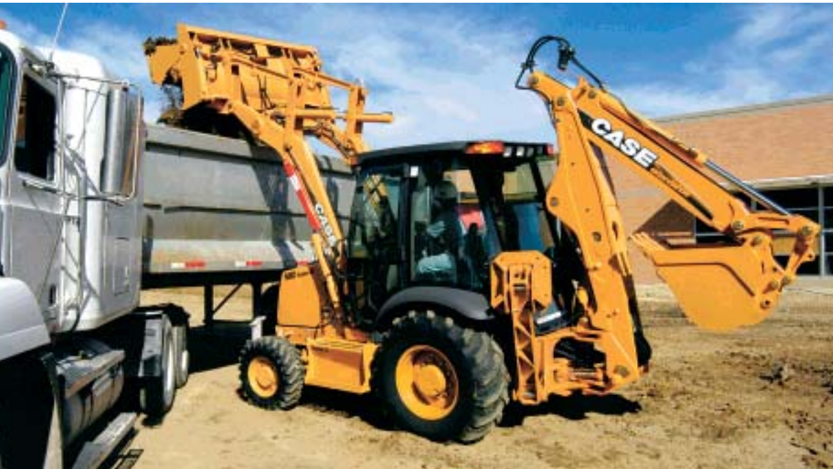
580 Super M

The worldwide leader in backhoe performance and productivity in the 15 foot class.