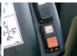
Pilot Control – in cab locking pattern change switch from backhoe to excavator control.