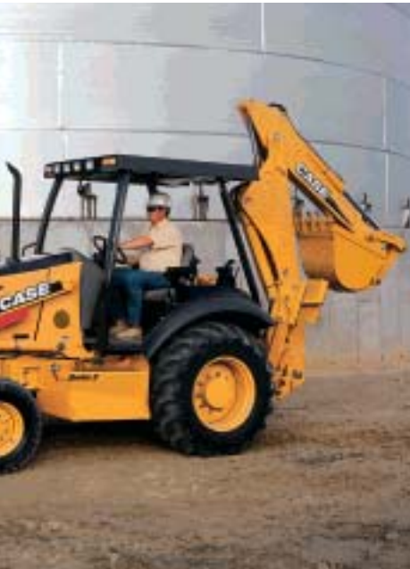
The versatile loader backhoe that delivers extra horsepower for high altitudes and contractors needing increased loader and transport speed.