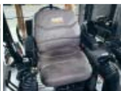
Low-effort Pilot Control – the ultimate in operator comfort.