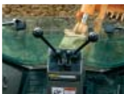
Manual 2-lever backhoe control.